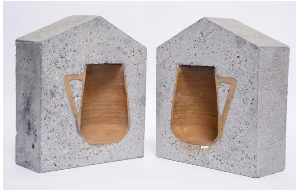
After Amnesia, 2016 Clay Object, cement casting 13" x 11" x 5" (33 x 28 x 12 cms)