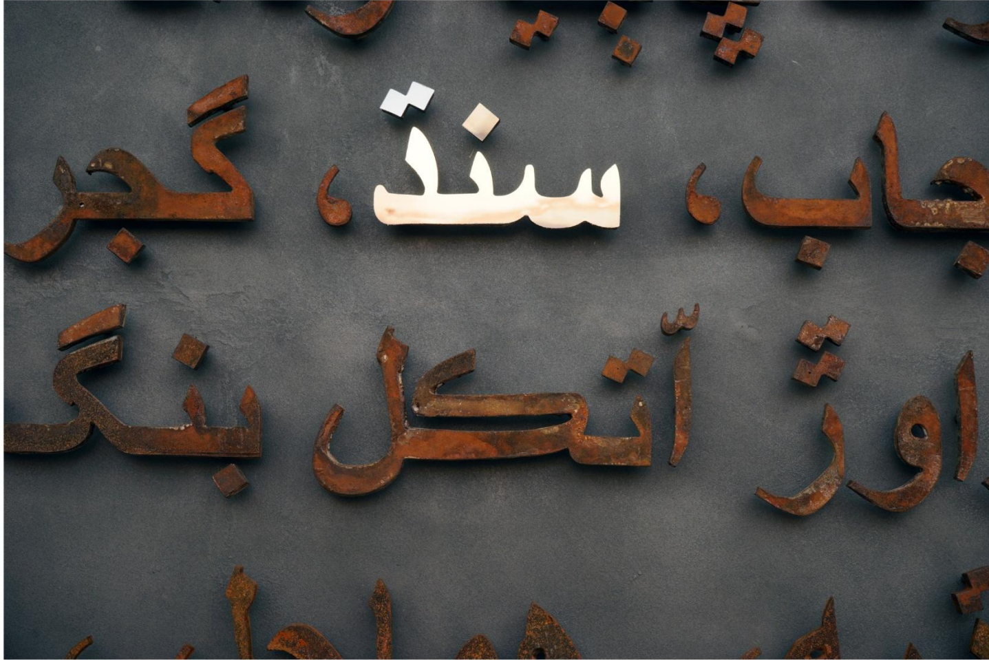
Detail Sindh-Hind, 2016