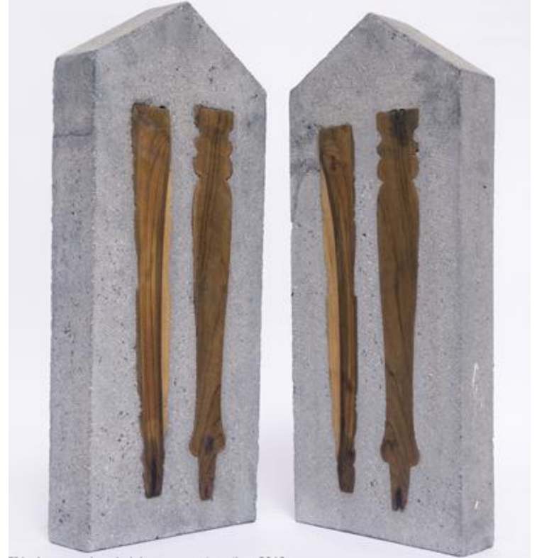
After Amnesia, 2016 Wooden chair legs, cement casting 20" x 8" x 2.5" (51 x 20 x 6 cms)