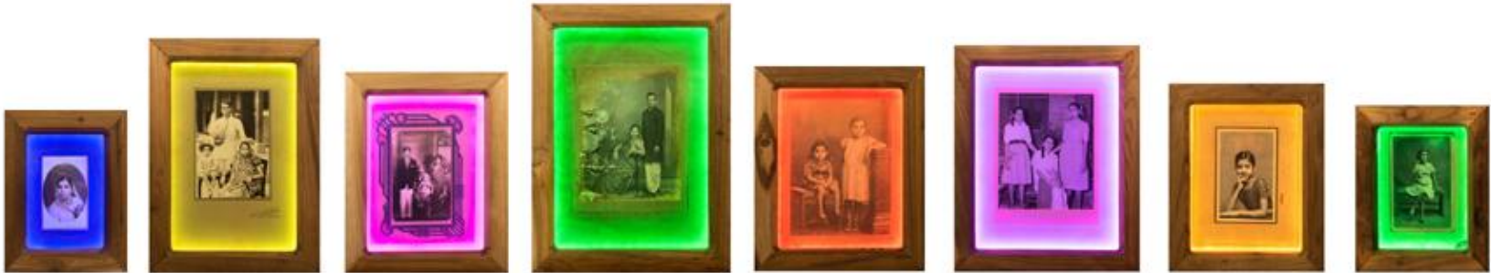
Detail Witnesses-II, 2016