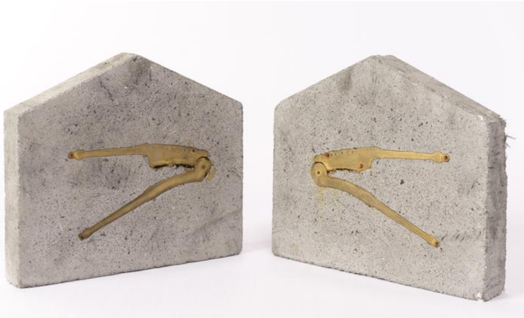
After Amnesia, 2016 Metal Object, cement casting 8" x 9" x 1.75" (20 x 23 x 4 cms)