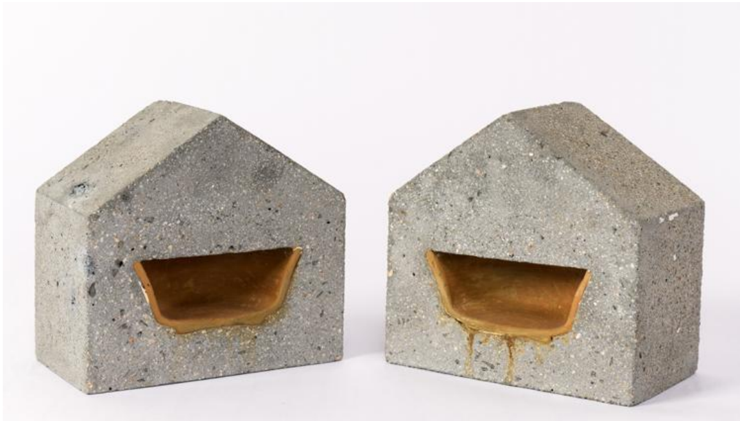
After Amnesia, 2016 Clay Object, cement casting 6" x 6" x 3.5" (15 x 15 x 8 cms)