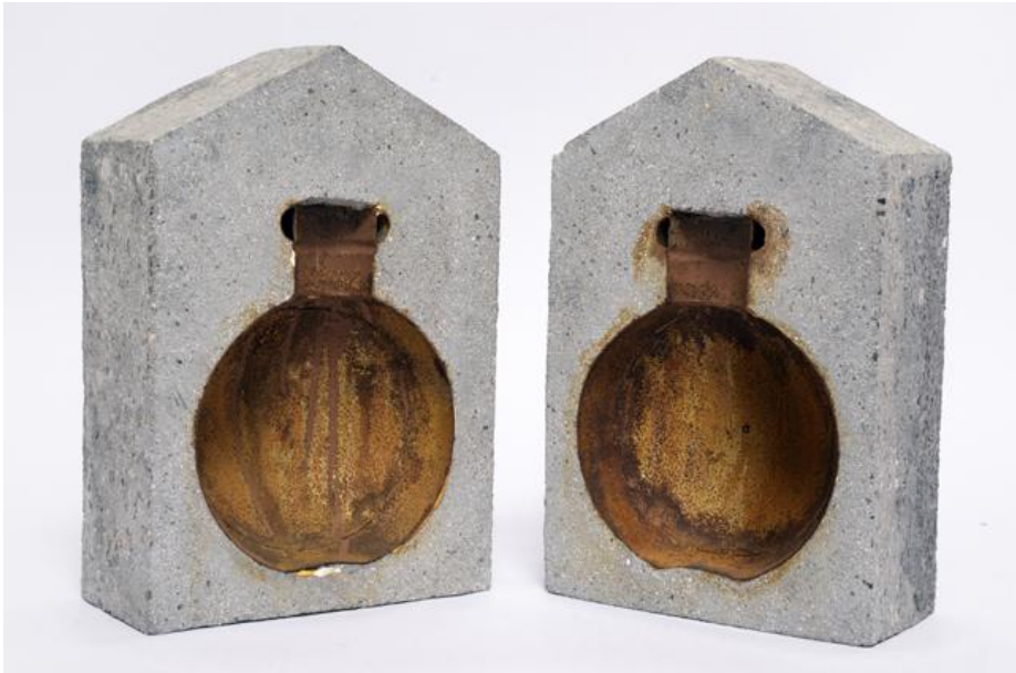
After Amnesia, 2016 Iron Object, cement casting 12" x 8" x 4" (30 x 21 x 10 cms)