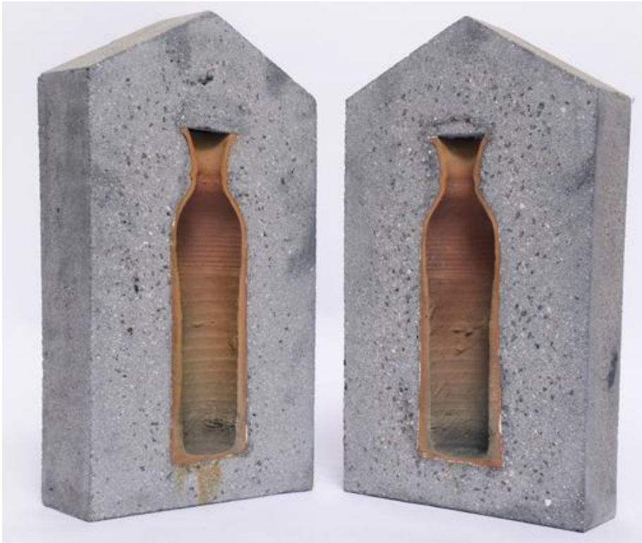
After Amnesia, 2016 Clay Object, cement casting 17.5" x 9.5" x 3.5" (44 x 24 x 9 cms)