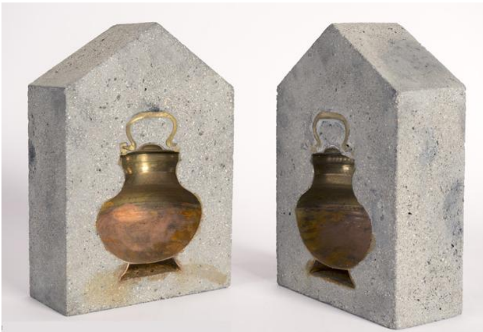
After Amnesia, 2016 Metal Object, cement casting 11" x 7.5" x 3.5" (28 x 19 x 9 cms)