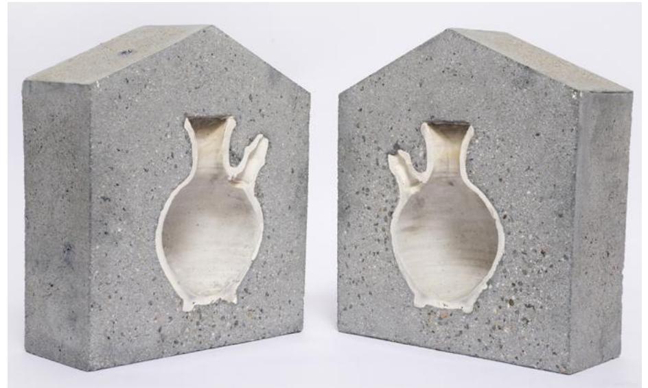
After Amnesia, 2016 Clay Object, cement casting 13" x 11" x 4.5" (33 x 28 x 11 cms)