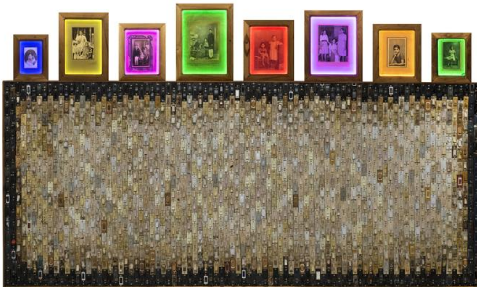
Witnesses-II, 2016 Old used electric switches on board Old black and white photographs, interactive light installation 54" x 84" (137 x 213 cms)