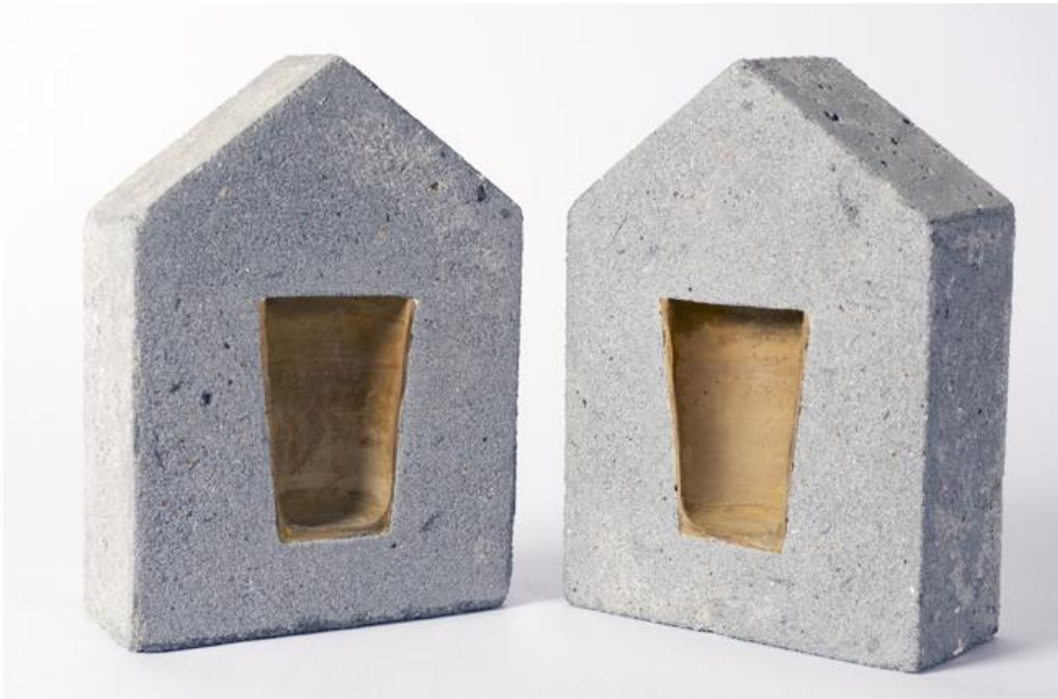
After Amnesia, 2016 Clay Object, cement casting 10" x 7" x 3" (25 x 18 x 7 cms)