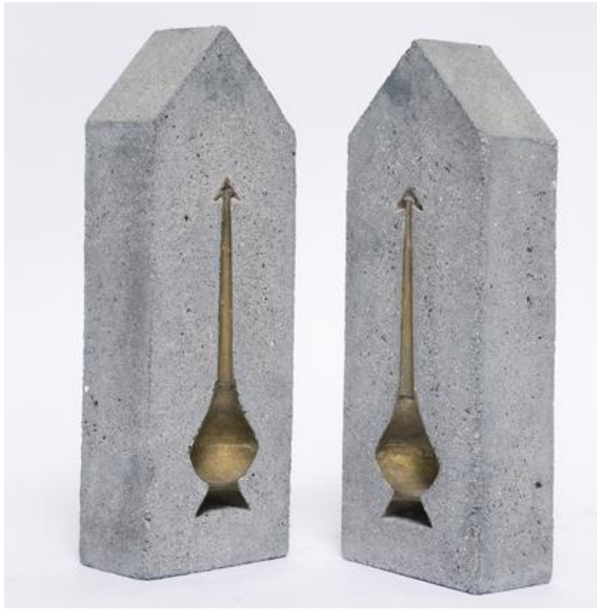
After Amnesia, 2016 Metal Object, cement casting 14" x 5" x 3" (35 x 13 x 8 cms)