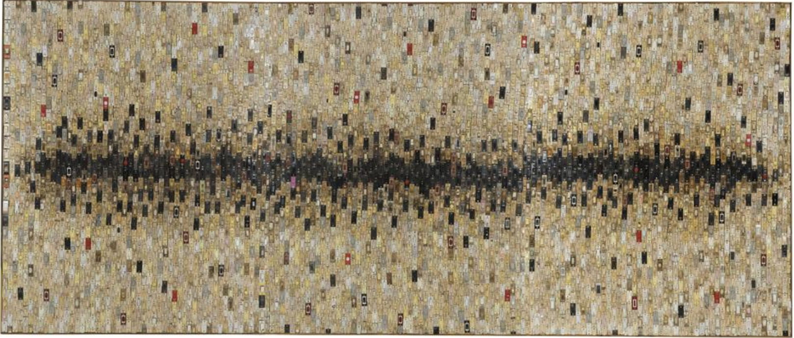
Witnessess-I, 2016 Old used electric switches on board Multiple interactive sound installation 60" x 144" (152 x 366 cms) triptych