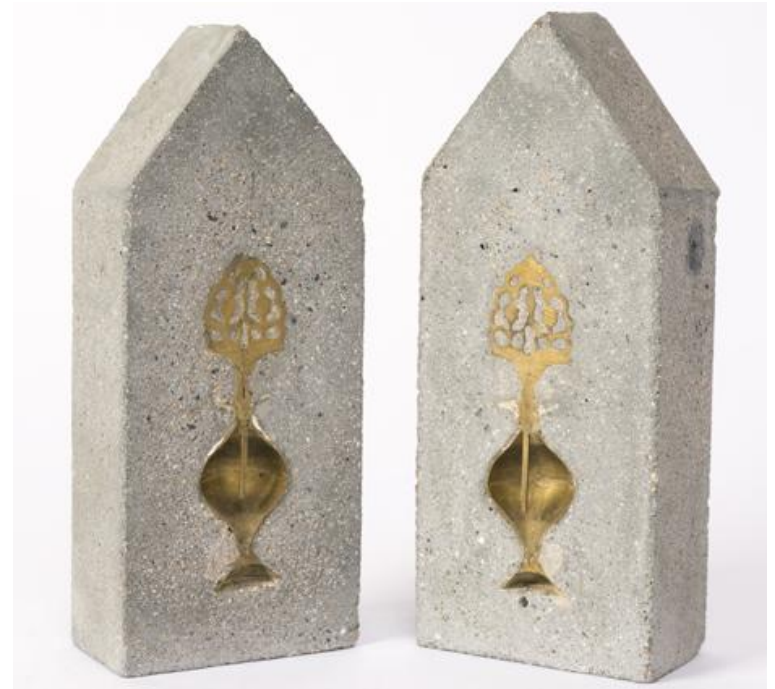
After Amnesia, 2016 Iron Object, cement casting 9" x 9" x 3" (23 x 23 x 7 cms)