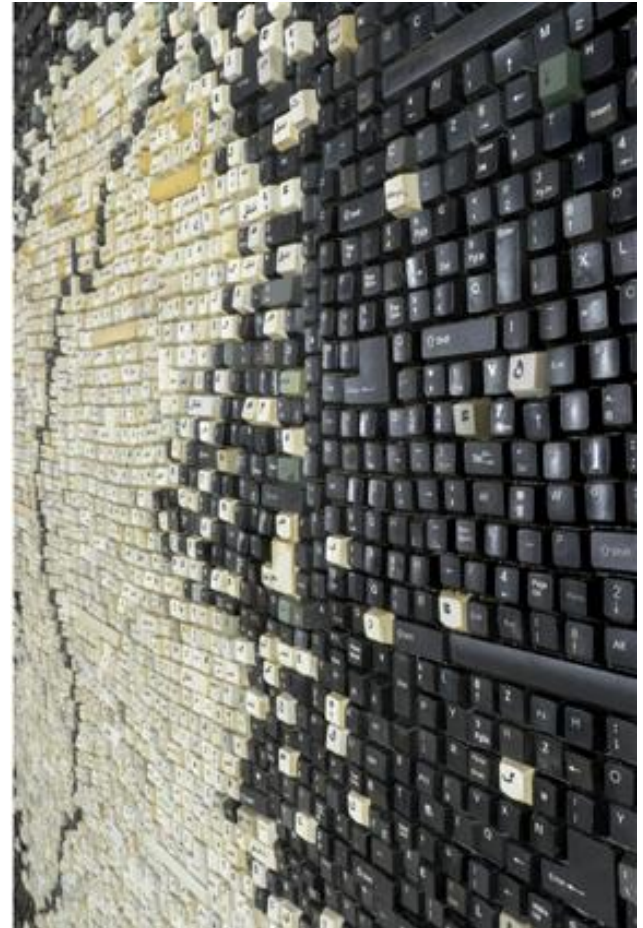
Detail Map of Language-II, 2016