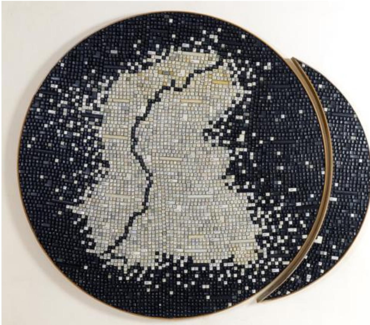
Map of Language-II, 2016 Print on computer keys on board 60" x 70" (152 x 178 cms)